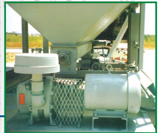
Automatic Recycle System