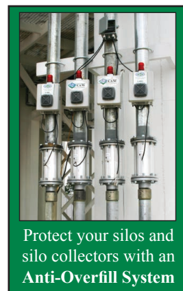
Protect your silos and silo collectors with an Anti-Overfill System