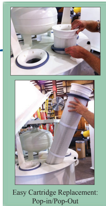
Easy Cartridge Replacement: Pop-in/Pop-Out